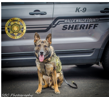
Current K9 Patrol Dog Gudy

We are looking for donations to our restricted K9 fund. Thank you to these local businesses and people: Anonymous (1), Columbia REA, Ranch & Home, & Walla Walla Valley Honda, for your most recent donation!